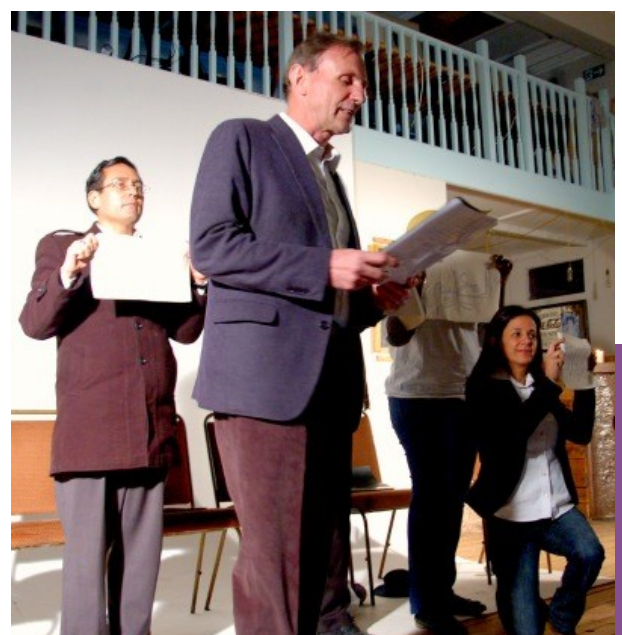
Fellows perform at York Theatre Royal's De Grey Rooms for International Women's Day (left) and at Orillo Studio for International Human Rights Day (above).