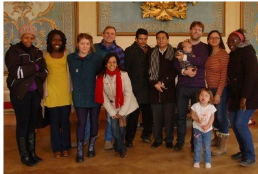
Fellows and staff at a retreat in Northumberland, December 2014.

To learn more about the Fellowship Scheme and to hear first hand from human rights defenders about their work on the frontline, follow us on Facebook and Twitter .